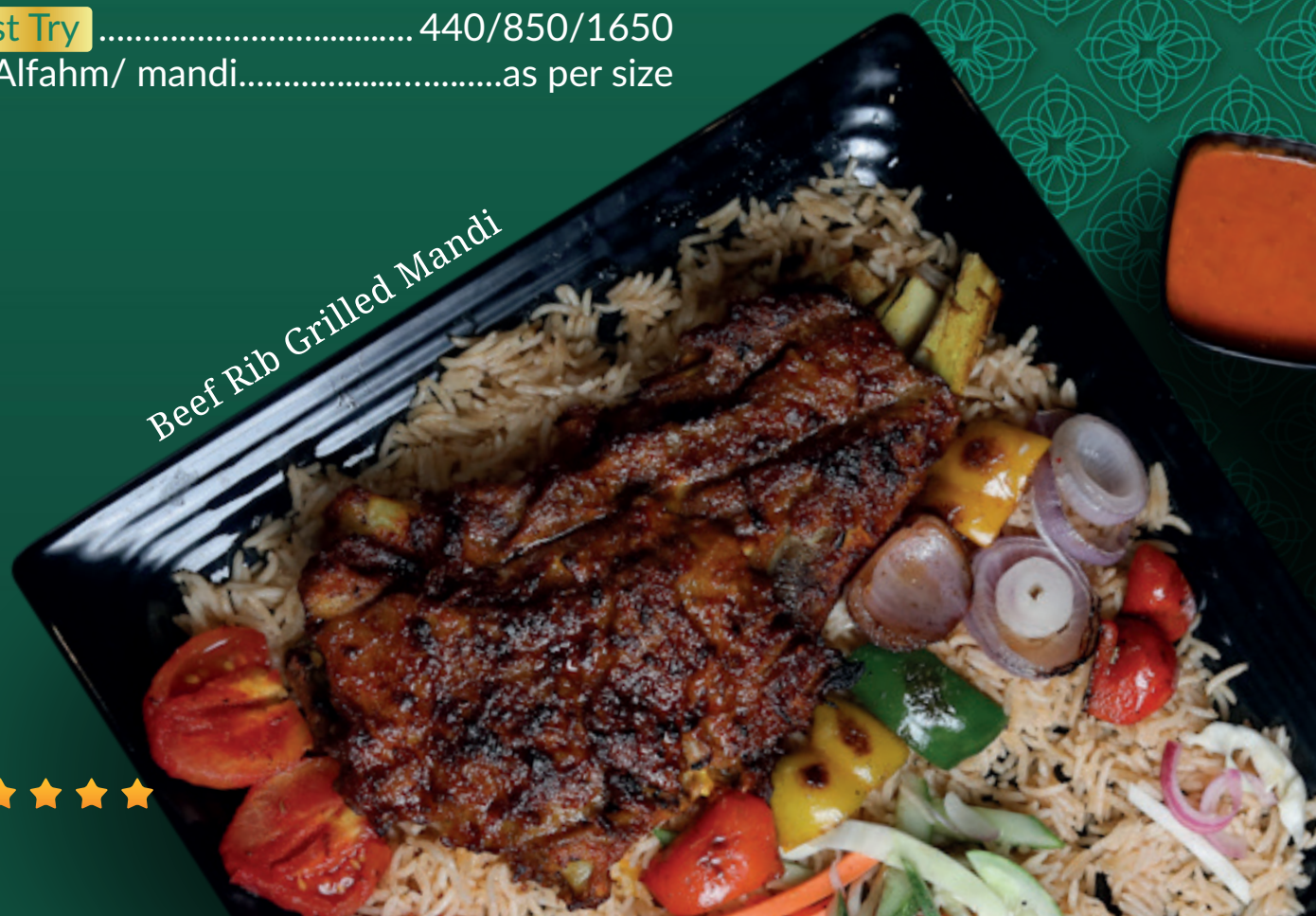
Beef Rib Grilled Mandi