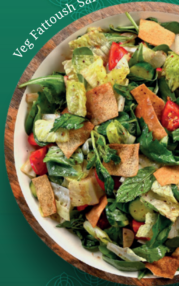
Veg Fattoush Salad