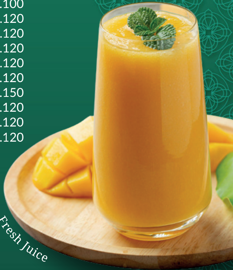
Mango Fresh Juice