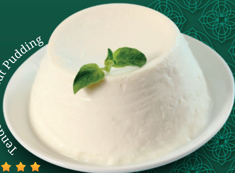
Tender Coconut Pudding

*A LA CARTE ORDERS TAKE 15 MINS PREPARATION TIME